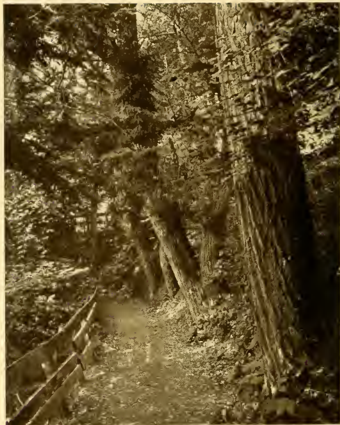
WALK ALONG NORTH GORGE